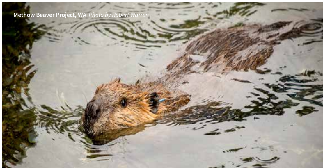
Methow Beaver Project, WA

Sharing results externally can also contribute valuable knowledge about restoration approaches and outcomes and elevate the work of the partnership. Sharing results through professional networks and/or peer-reviewed publications can infuse new ideas and innovation from outside the partnership and also give partnership members access to new and emerging science and management innovations that may be applicable to their work. Encouraging staff to present or publish their results can provide individual incentives in terms of an expanding professional network and professional accolades, which can motivate staff to invest the time and energy needed to strive for excellence in the context of adaptive management.