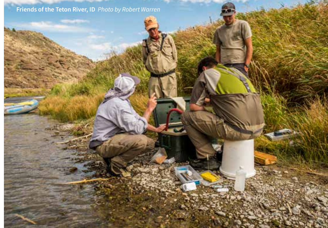
Friends of the Teton River, ID

Ideally, the statistical analysis approach is determined during the design phase, and if appropriate, a statistical power analysis can be completed to determine the sample size needed to determine statistical significance. Involving researchers, monitoring specialists and/or statisticians early in the development of the treatment design and study plan is key to increasing the likelihood that the methods used will yield results that are meaningful in the adaptive management process, are credible to partners and stakeholders, and can be used to enhance the effectiveness of restoration actions. For an example of highly rigorous experimental design, see Asotin Creek Intensively Monitored Watershed: Updated Study Plan . 6